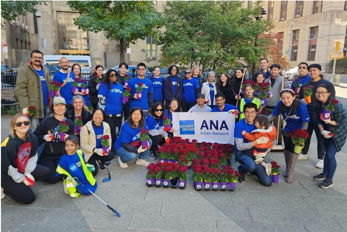
Volunteers from American Express helped plant flowers and daffodil bulbs at Collect Pond Park. (Oct 19, 2024)